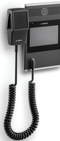
PRA-CSLW with hand-held microphone

This call station for use in PRAESENSA Public Address and Voice Alarm systems is easy to install and intuitive to operate because of its touch screen LCD, providing clear user feedback about setting up a call and monitoring its progress, or controlling background music.