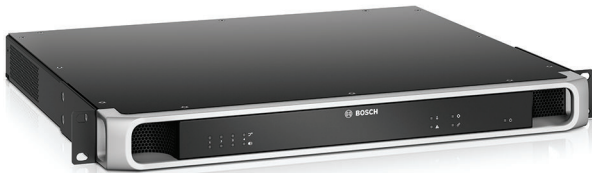
PRA-AD604 with 4 channels