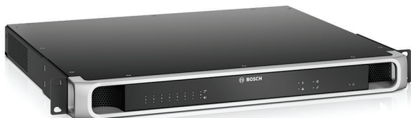
PRA-AD608 with 8 channels

This is a flexible and compact multi-channel power amplifier for 100 V or 70 V loudspeaker systems in Public Address and Voice Alarm applications. It fits in centralized system topologies, but also supports decentralized system topologies because of its OMNEO IP-network connection, combined with DC-power from a multifunction power supply. The output power of each amplifier channel adapts to the connected loudspeaker load, only limited by the total power budget of the whole amplifier. This