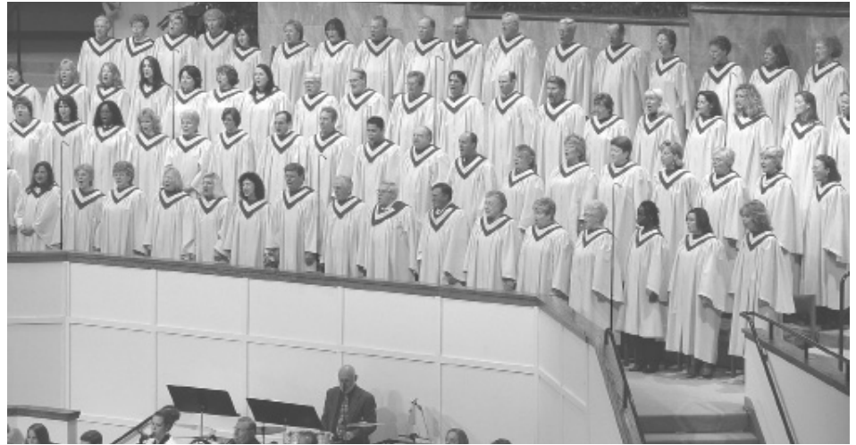
Find the FW730 7 ft. FlexWands in the above photograph. How many FlexWands do you see?

During the last decade it has become commonplace for sound recording and broadcast equipment to accommodate extended frequency responses up to and beyond 100kHz. With few exceptions, even the very best of conventional professional microphones do not offer frequency responses above 20kHz. However, making a High Definition Microphone™ involves far more than extending the frequency response. Impulse response, diaphragm settling time and pristine electronics are also key elements. Earthworks' founder David Blackmer foresaw the need for higher quality microphones. Earthworks has been offering High Definition microphones, with extended frequency response beyond 40kHz, since 1996. Earthworks High Definition Microphones™ have an extremely clean, natural on-axis pickup, and smooth, uncolored off-axis response with high front-to-back rejection that makes them superb for a wide range of applications including sound reinforcement, broadcast, and recording of voice and musical instruments. You will hear exceptional sound quality that is extremely accurate, detailed, open and crystal clear even on 16 bit, 44.1kHz recording systems as well as analog or digital sound systems that are limited to a 15kHz or 20kHz bandwidth. You will hear a remarkable improvement in sound quality on nearly all audio systems when using Earthworks High Definition Microphones™.