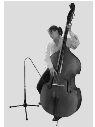
Various applications of the 4 ft. FW430 FlexWand Microphone System