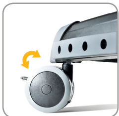
Caster base with locking wheels