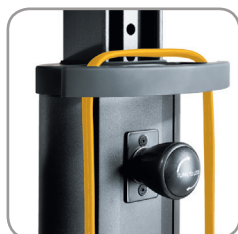
AC cord wrap for hassle-free transport

Dedicated to being a one-stop-shop for professional products, OmniMount remains on the cutting edge of product innovation. That's why we're the natural choice for any professional, industrial or commercial application. Understanding the needs of the market, OmniMount manufactures a full line of carts and stands that are second to none. The PROHDCART is a heavy duty flat panel cart offering convenient mobility and functionality.