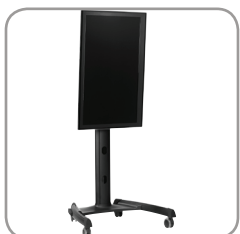
Portrait or landscape orientation