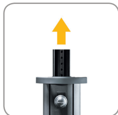
Telescoping height adjustment